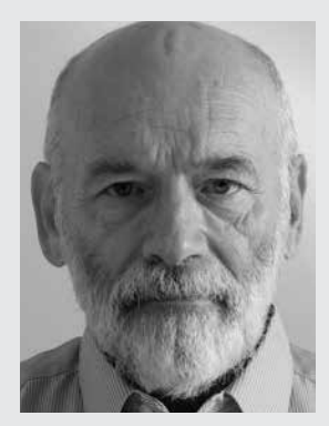
Putin lost the gas war.

enough to induce further savings by households and force European industry to switch to more high value-added, less energy-intensive products. If this process is allowed to continue to operate, and the green transition towards renewables accelerates, Europe will emerge as a winner in the long run as well.